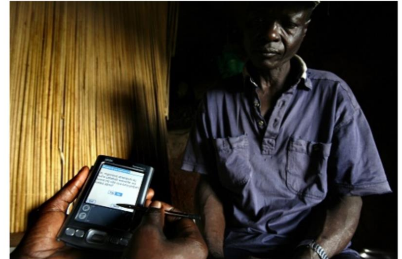
An outreach worker uses a PDA device to keep track of her patient's health during a home visit in western Kenya, where an electronic record system has revolutionized HIV care.